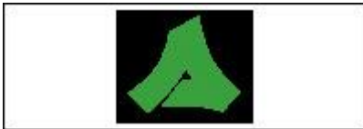
Alucan (Pvt) Ltd.