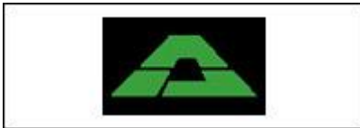
Alupak (Pvt) Ltd.